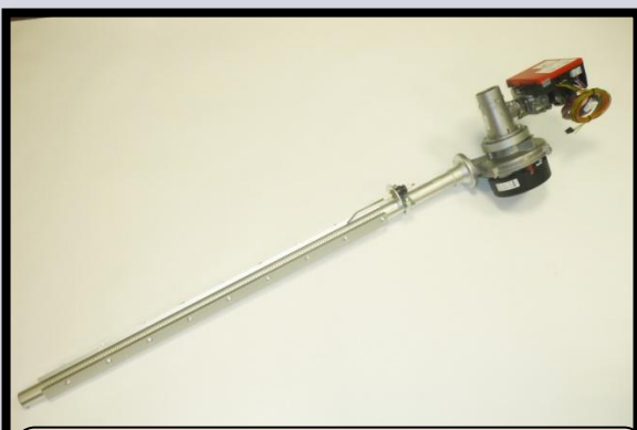
Premix bar burner of 21 kW diameter 34mm, in iron steel.

Those burners are manufactured in compliance of the standards EN 203-1 and EN203-2-x and the GAR2016/426